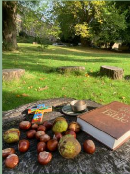
Music Nature Craft