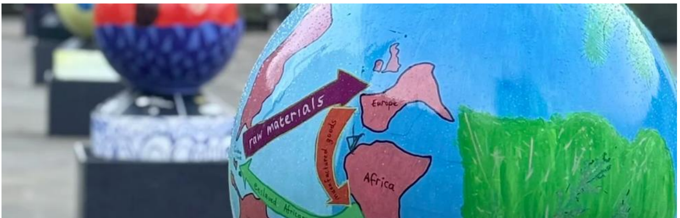
Triangle of Unity Art installation outside Sheffield Cathedral