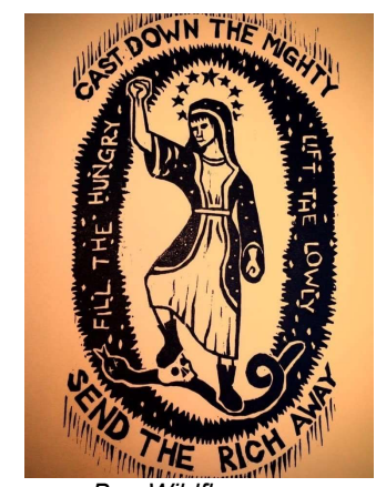
Ben Wildflower <a href="https://benwildflower.tumblr.com/">https://benwildflower.tumblr.com/</a>

Each session starts with a short time of prayer.